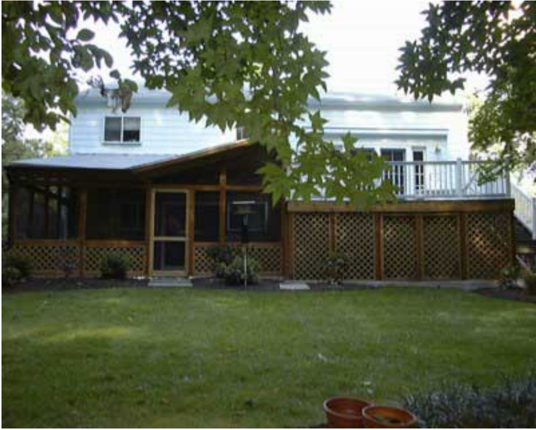
View of the rear of the Donner Residence with the new Screened Porch and Deck