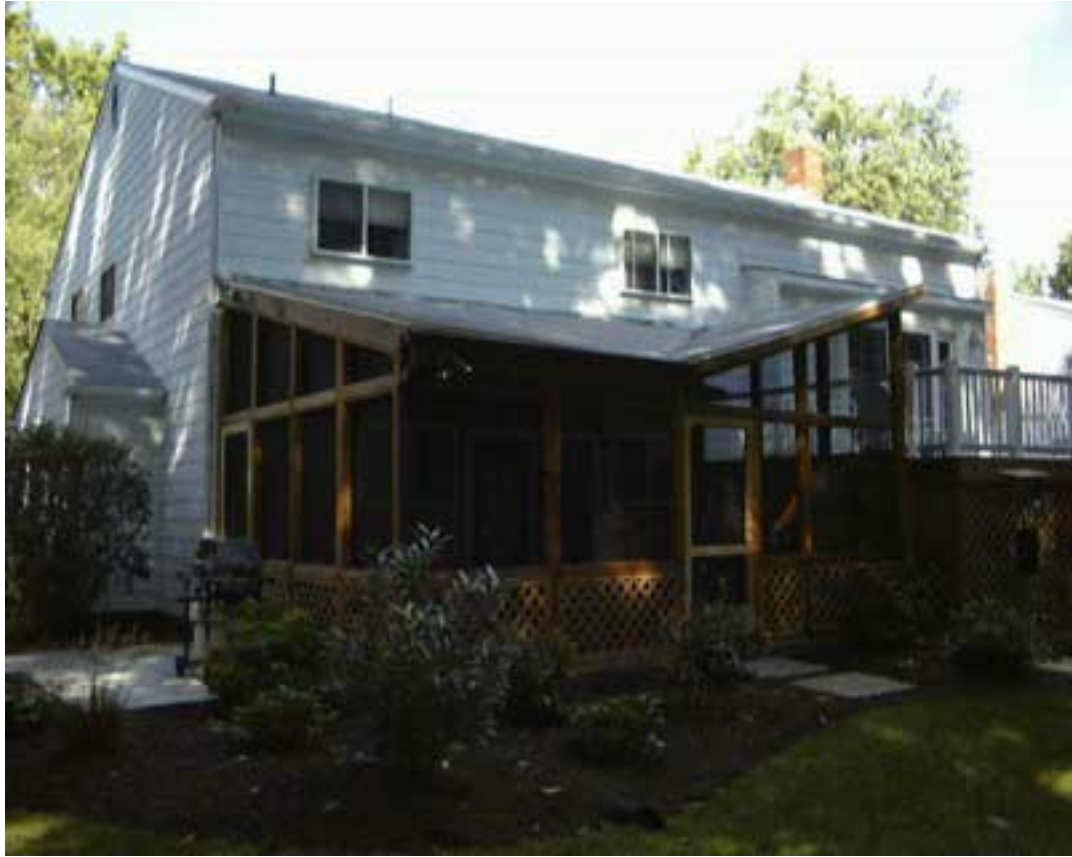
View of the rear of the new Screened Porch, Deck beyond