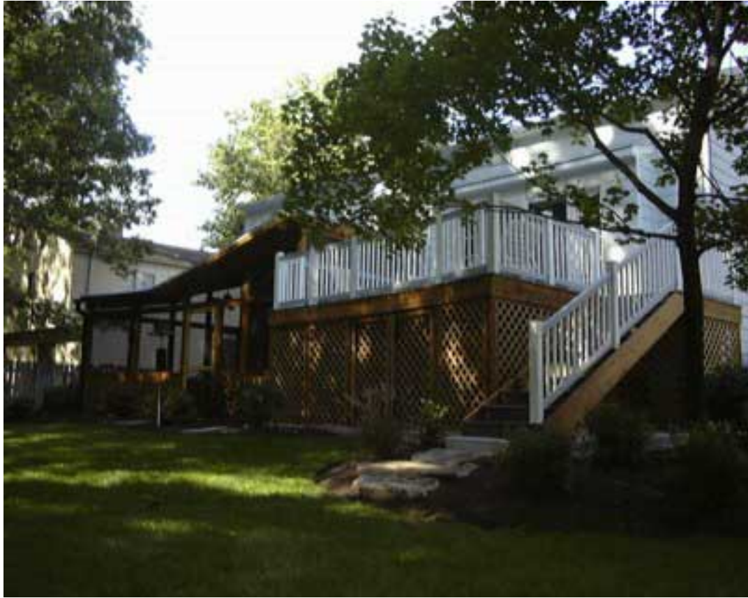
View of the rear of the new Deck, Screened Porch beyond